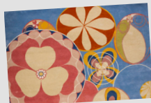
Hilma af Klint