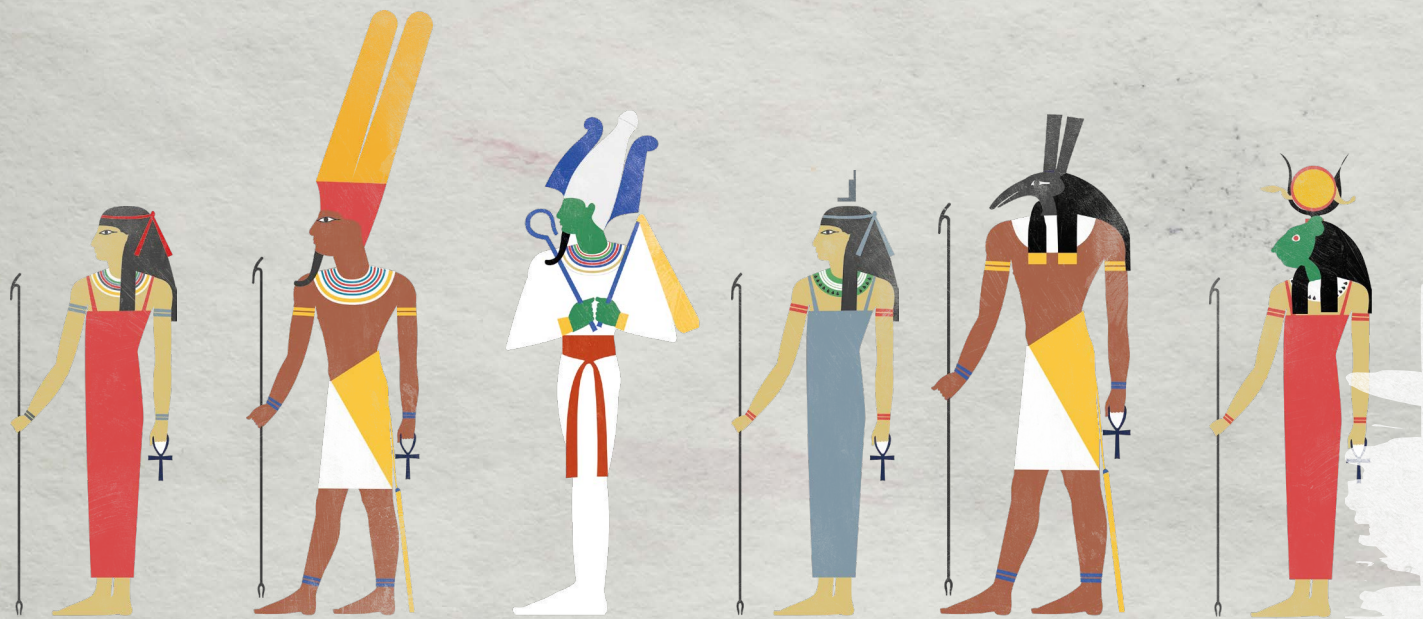
Nephthys was the goddess of mourning, night, rivers and sleep. Amun was the ancient Egyptian god of the air, sun and the sky. Osiris was the Egyptian god of death, the Underworld and Rebirth. Isis goddess of protection, healing, motherhood, children and nature. Seth was known as the god of chaos. Sekhmet was the goddess of power and might.