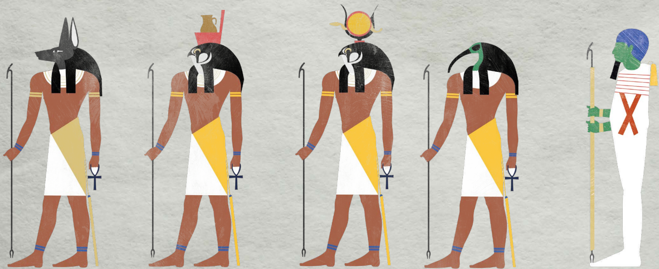
Anubis was linked to the mummification process as well as the journey to the afterlife. Horus was the Egyptian god of the Sky. Ra was the Sun god. Thoth was the god of knowledge, wisdom and hieroglyphs. Ptah was the god of creation and craftsmen.