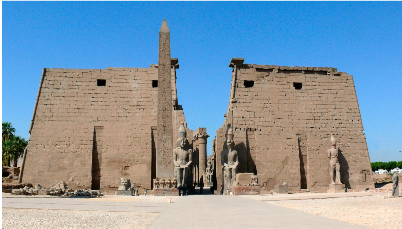
The Luxor Temple constructed approximately 1400 BCE