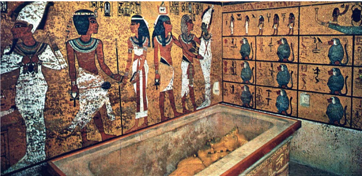
Elaborate wall decorations and expensive jewellery found within Egyptian tombs.

The ancient Egyptians believed that life in the Duat was better than life on earth.