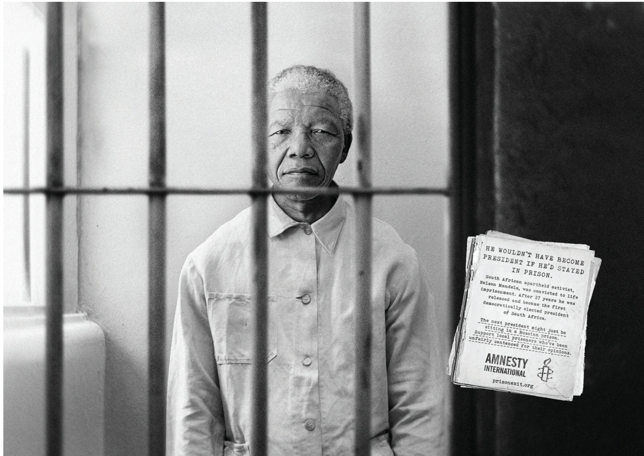
Two on Mandela the Prisoner

Today you will write 3 more paragraphs for your biography.