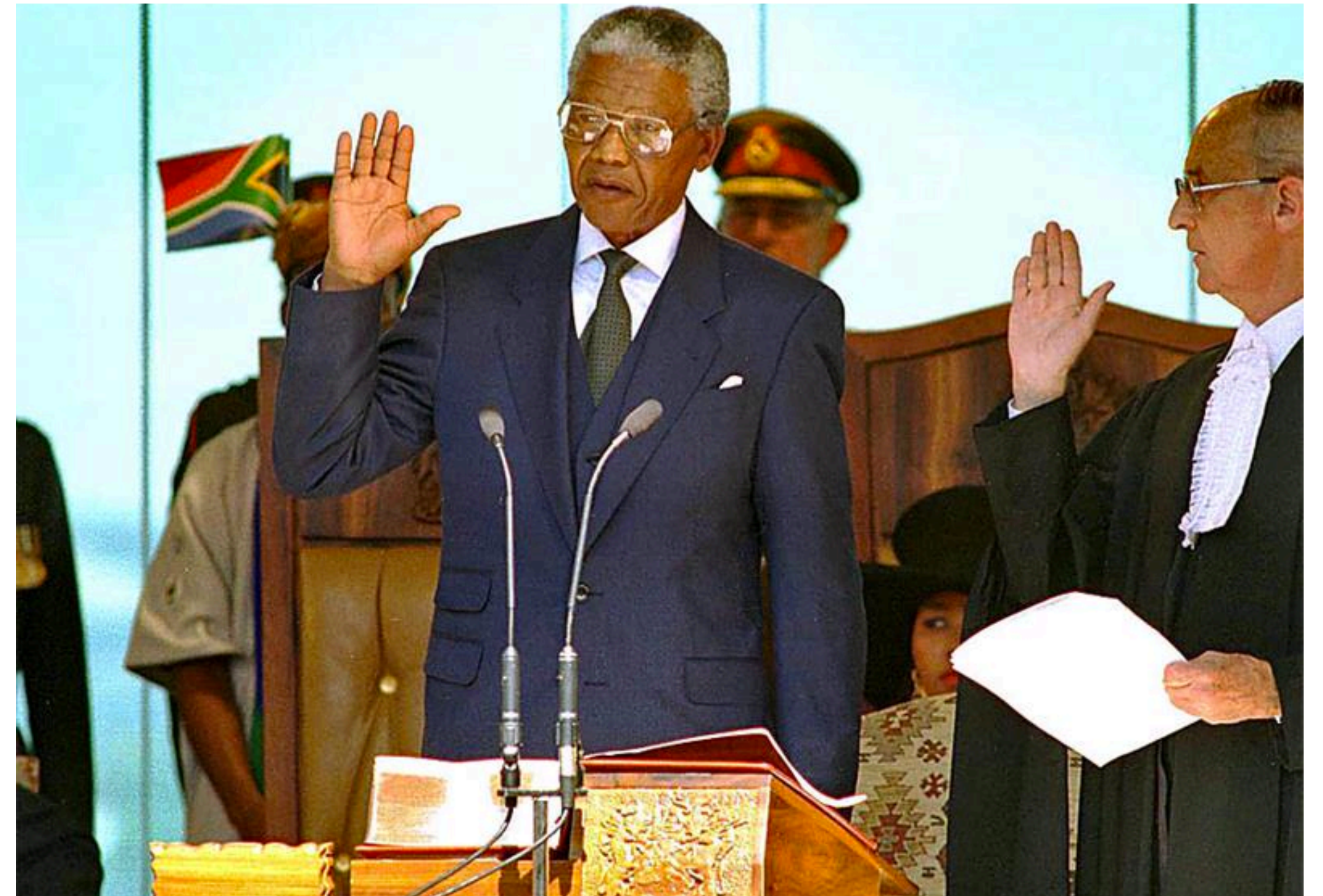
One on Mandela the President