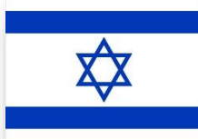
Flag of Israel

There has been dispute over who should get to oversee Jerusalem for thousands and thousands of years.