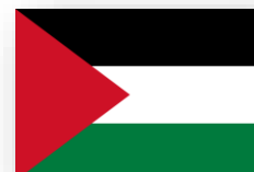
Flag of Palestine