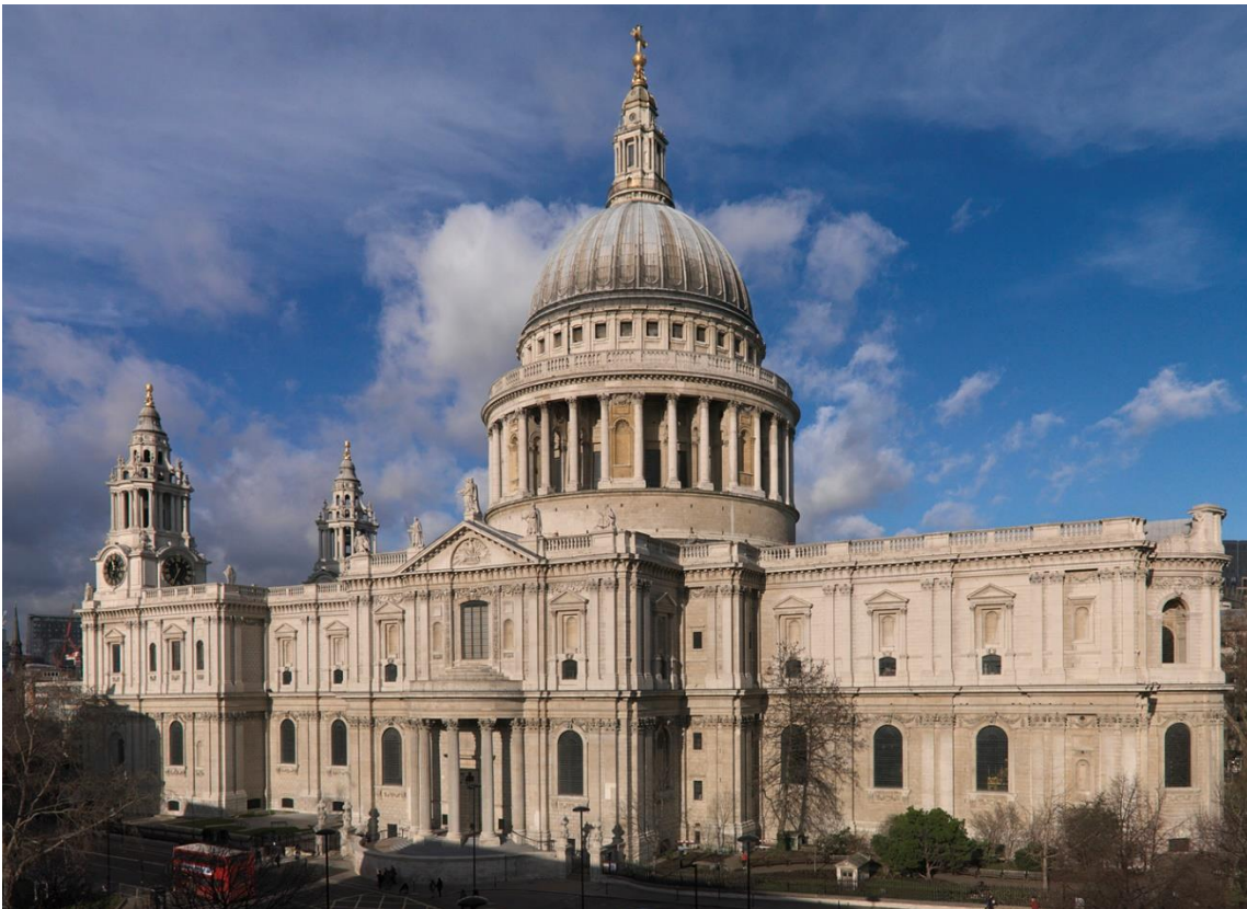
St Paul's Cathedral today