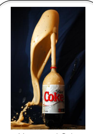
Mentos and Coke volcano