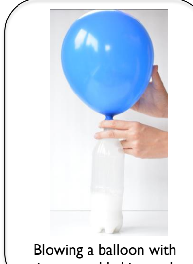
vinegar and baking soda

Try some experiments at home - preferably outside and with an adult's permission!