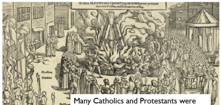
Many Catholics and Protestants were killed in the course of the Reformation

They broke away from the Catholic church and founded various Protestant churches.