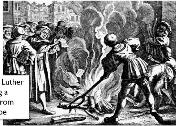
Martin Luther burning a letter from the Pope

The Pope condemned Luther's teachings. But Luther's message spread quickly.