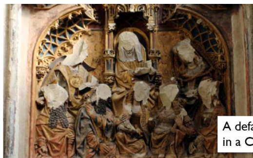
A defaced monument in a Catholic church