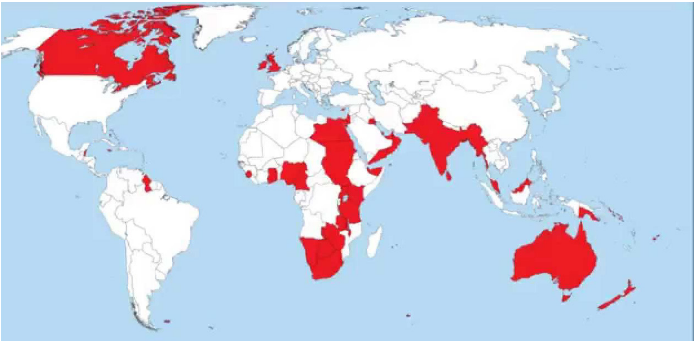
Map showing the British Empire

Perhaps the greatest achievement for England at the time was the continuous defeat of Spanish fleets and the treasure and spices they brought back with them as a result of years of plundering..