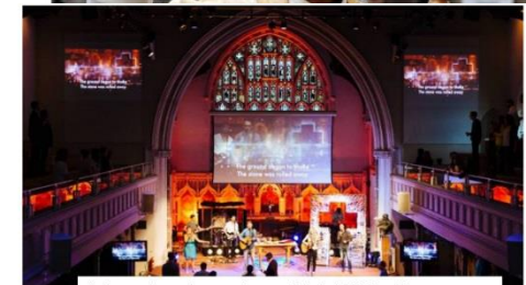
A low church service at Holy Trinity Brompton

Other churches are high church which means their worship is more similar to Catholic worship with incense, candles and traditional set prayers.