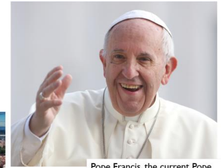
Pope Francis, the current Pope

The leader of the Catholic church is the Pope and the centre of the global church is in Rome in the Vatican City .