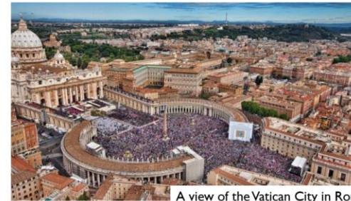
A view of the Vatican City in Rome